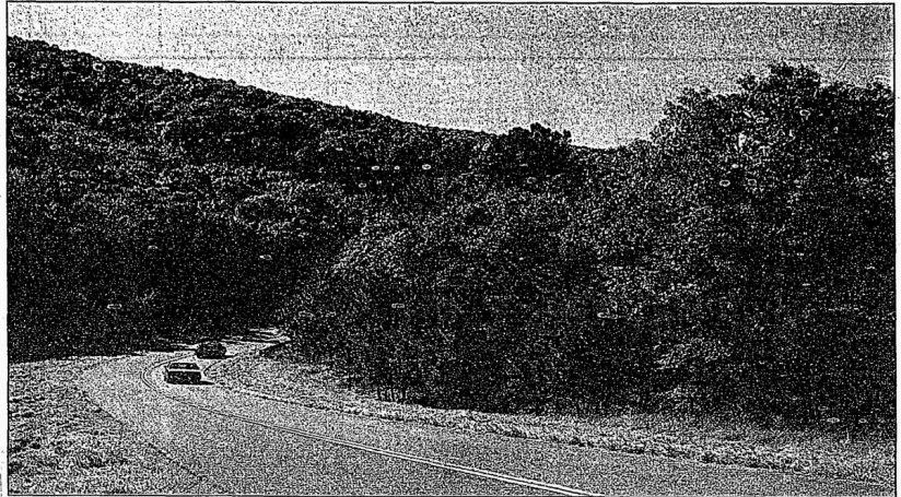
The Talimena Scenic Drive goes through the Ouachita Mountains, the highest mountains between the Appalachians and the Rockies. The drive, mainly in Oklahoma, has 17 miles in Arkansas.

— The Robert S. Kerr Arboretum extends from mile 29.8 on the east to mile 31.6 on the west. The entrance is at mile 30.7.