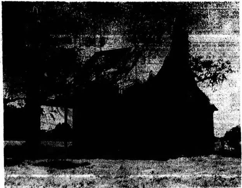
This is a replica of old stage station.