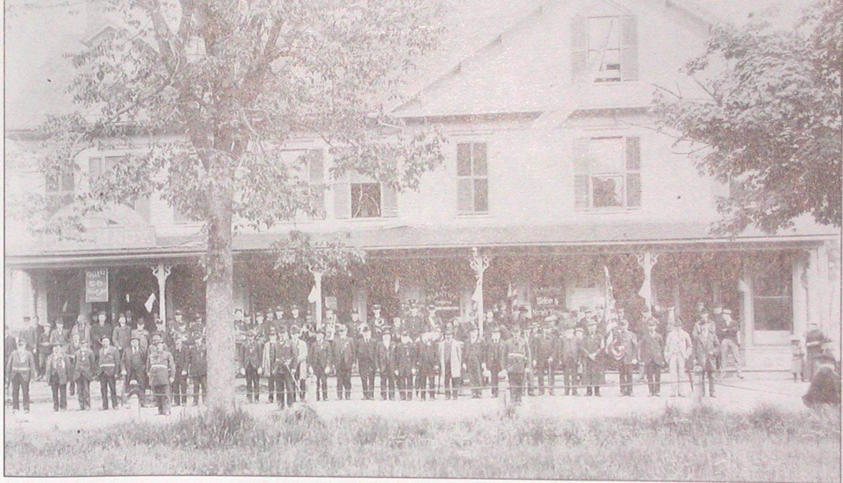
THE GRAND ARMY OF THE REPUBLIC IN FRONT OF THE GOULD BLOCK. There was a meeting room on the second floor of the Gould Block where the GAR convened. In the early 1900s, the Union Grange took over the space and met there until 1973. The Grand Army of the Republic initiated the project of building the Soldiers' Monument on the common. Funds were raised by subscription and from a town appropriation.