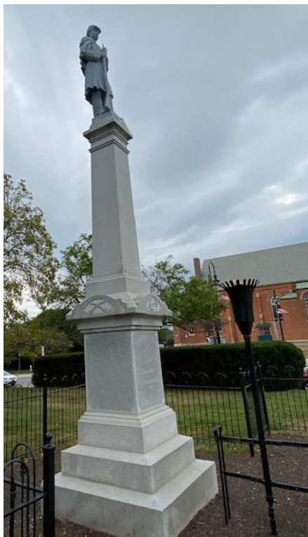
← East View of monument