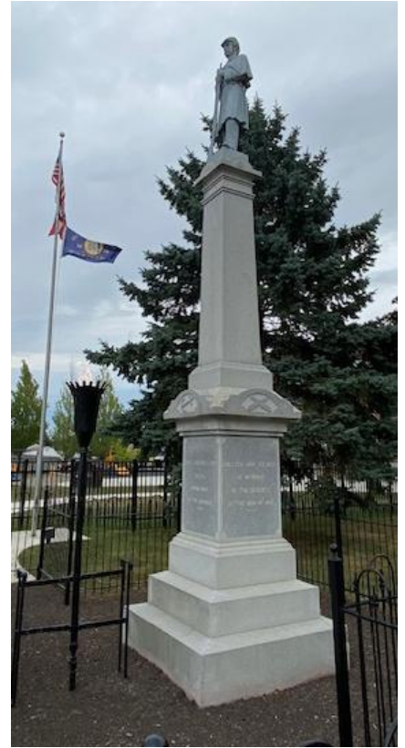
West Side of Monument