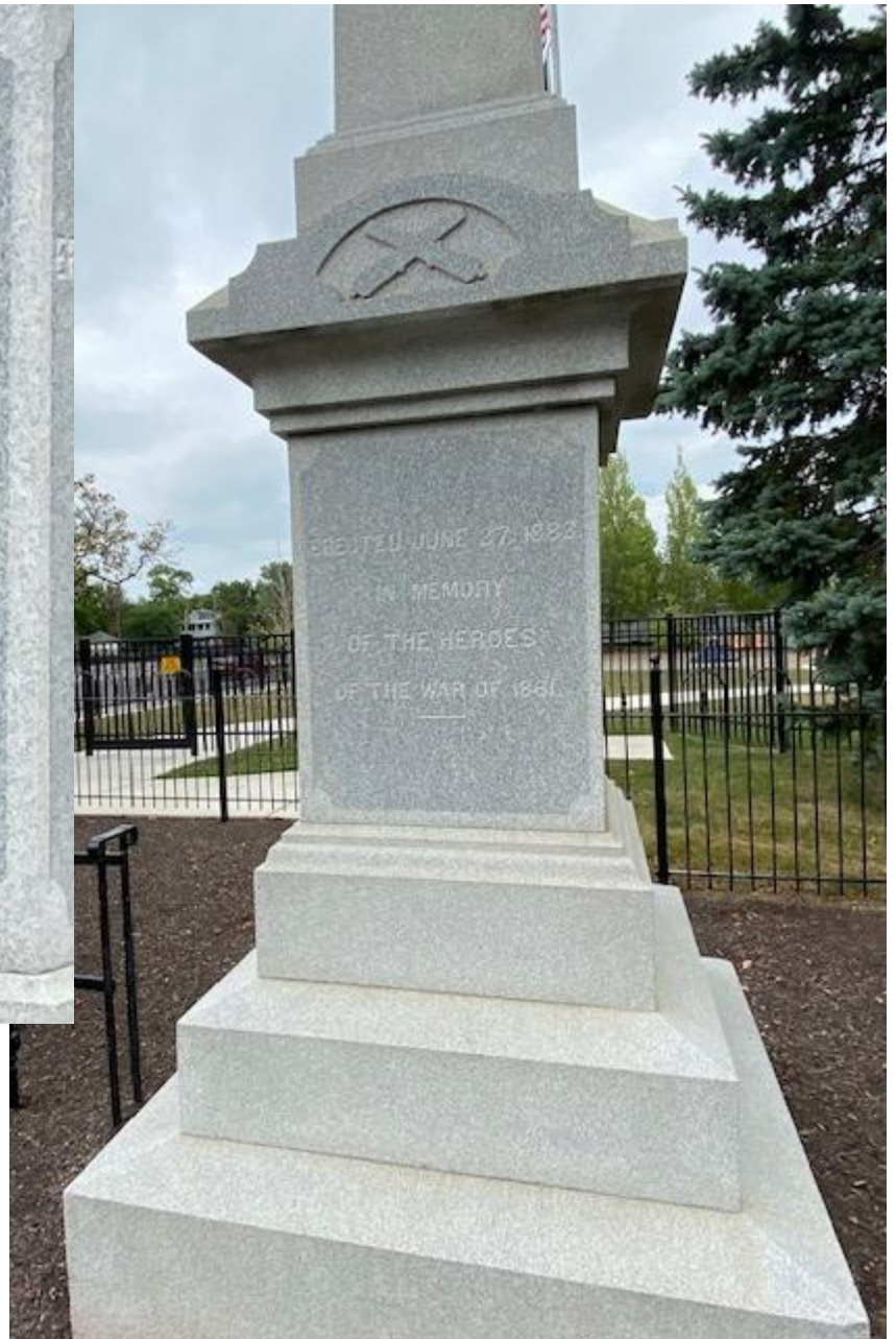
On West side of Monument