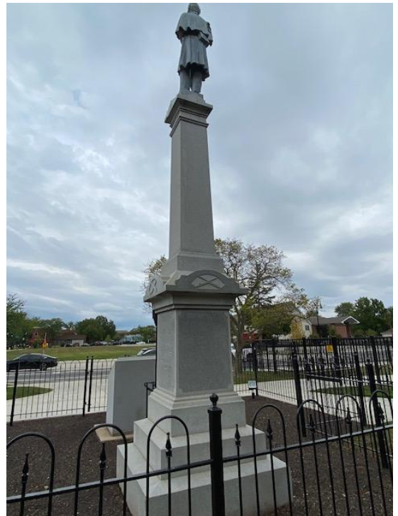
Back of monument -->