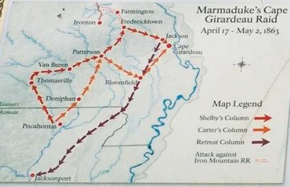
Marmaduke's Cape Girardeau Raid April 17 - May 2, 1863

Marmaduke was pursued south, fighting delaying actions at the Whitewater and Castor rivers. On May 1, he reached the flooded St. Francis River at Chalk Bluff, where his rearguard held back the Federals while his division crossed and escaped into Arkansas. The raid had been a disappointment; little damage had been done to the Federals, and the unnecessary battle at Cape Girardeau almost led to the Confederate's destruction. Federal operations in the Mississippi Valley had not been hindered. Vicksburg fell in July and Little Rock in September.