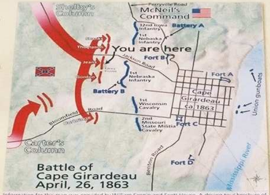
Battle of Cape Girardeau April 26, 1863