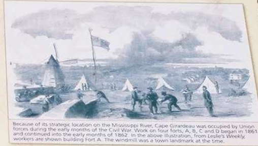
Because of its strategic location on the Mississippi River, Cape Girardeau was occupied by Lincoln's forces during the early months of the Civil War. Work on four forts, A, B, C, and D began in 1861 and continued into the early months of 1862. In the above illustration, from Leslie's Weekly, workers are shown building Fort A. The windmill is a town landmark at the time.

Marmaduke, meanwhile, accompanied Shelby's column to Fredericktown. From there they launched attacks against the Iron Mountain Railroad and could cut off any escape route by McNeil in the direction of Ironton. The advance on Bloomfield by Carter and Greene was plagued by rain and mud and the column became mired in an area known today as Mingo Swamp. The day lost in the swamp allowed McNeil to learn of the Confederate trap being laid and retreat to Cape Girardeau, a major Federal supply base. Carter dispatched messengers to inform Marmaduke of McNeil's escape, but the couriers were captured. Marmaduke and Shelby waited near Fredericktown until April 25, then realized that something was amiss and marched to Cape Girardeau where McNeil awaited their arrival.