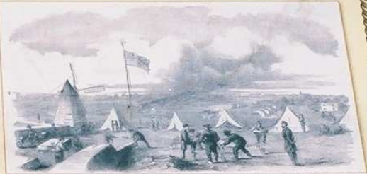
Because of its strategic location on the Mississippi River, Cape Girardeau was occupied by Union forces during the early months of the Civil War. Work on four forts, A, B, C and D began in 1861 and continued into the early months of 1862. In the above illustration, from Leslie's Weekly, workers are shown building Fort A. The windmill is a town landmark at the time.

Marmaduke, meanwhile, accompanied Shelby's column to Fredericktown. From there they launched attacks against the Iron Mountain Railroad and could cut off any escape route by McNeil in the direction of Ironton. The advance on Bloomfield by Carter and Greene was plagued by rain and mud and the column became mired in an area known today as Mingo Swamp. The day lost in the swamp allowed McNeil to learn of the Confederate trap being laid and retreat to Cape Girardeau, a major Federal supply base. Carter dispatched messages to inform Marmaduke of McNeil's escape, but the couriers were captured. Marmaduke and Shelby waited near Fredericktown until April 25, then realized that something was amiss and marched to Cape Girardeau where McNeil awaited their arrival.