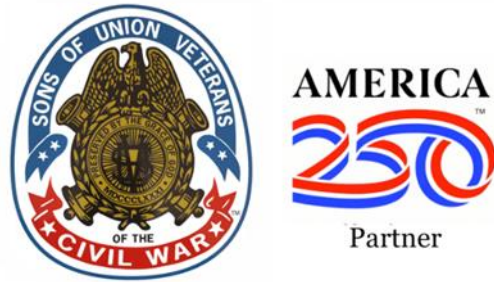
Figure 2: Proposed SUVCW A250 member participation medal