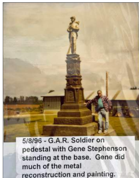
Otis the GAR soldier in his golden glory in 1996.

The Col. Edward D. Baker Camp No. 6 humbly requests grant assistance to get Otis back on duty guarding the graves of the seventy-one Union Civil War Veterans buried in Belle Passi Cemetery.