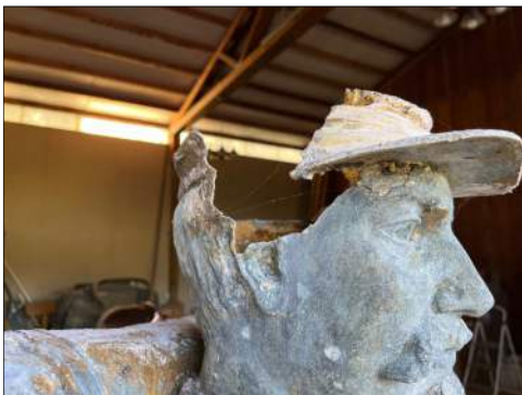
Close up of the tree damage to the statue's head.