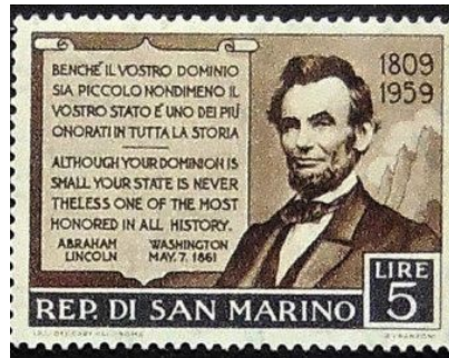
Lincoln has been honored three times on San Marino postage stamps

"We are acquainted from newspapers with political griefs, which you are now suffering therefore we pray to God to grant you a peaceful solution of your questions. Nevertheless we hope our letter will not reach you disagreeable, and we shall expect anxiously an answer which proves us your kind acceptance."