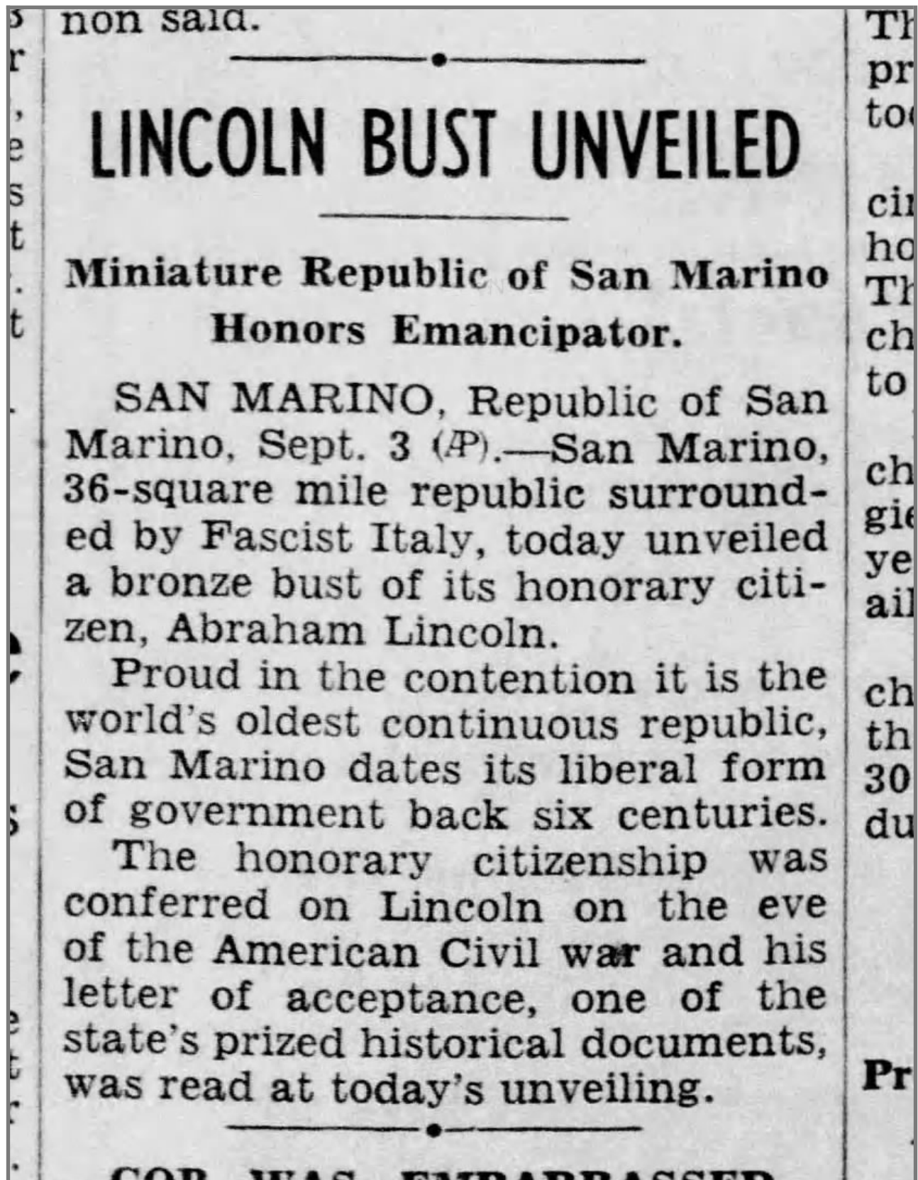
Lincoln bust unveiled