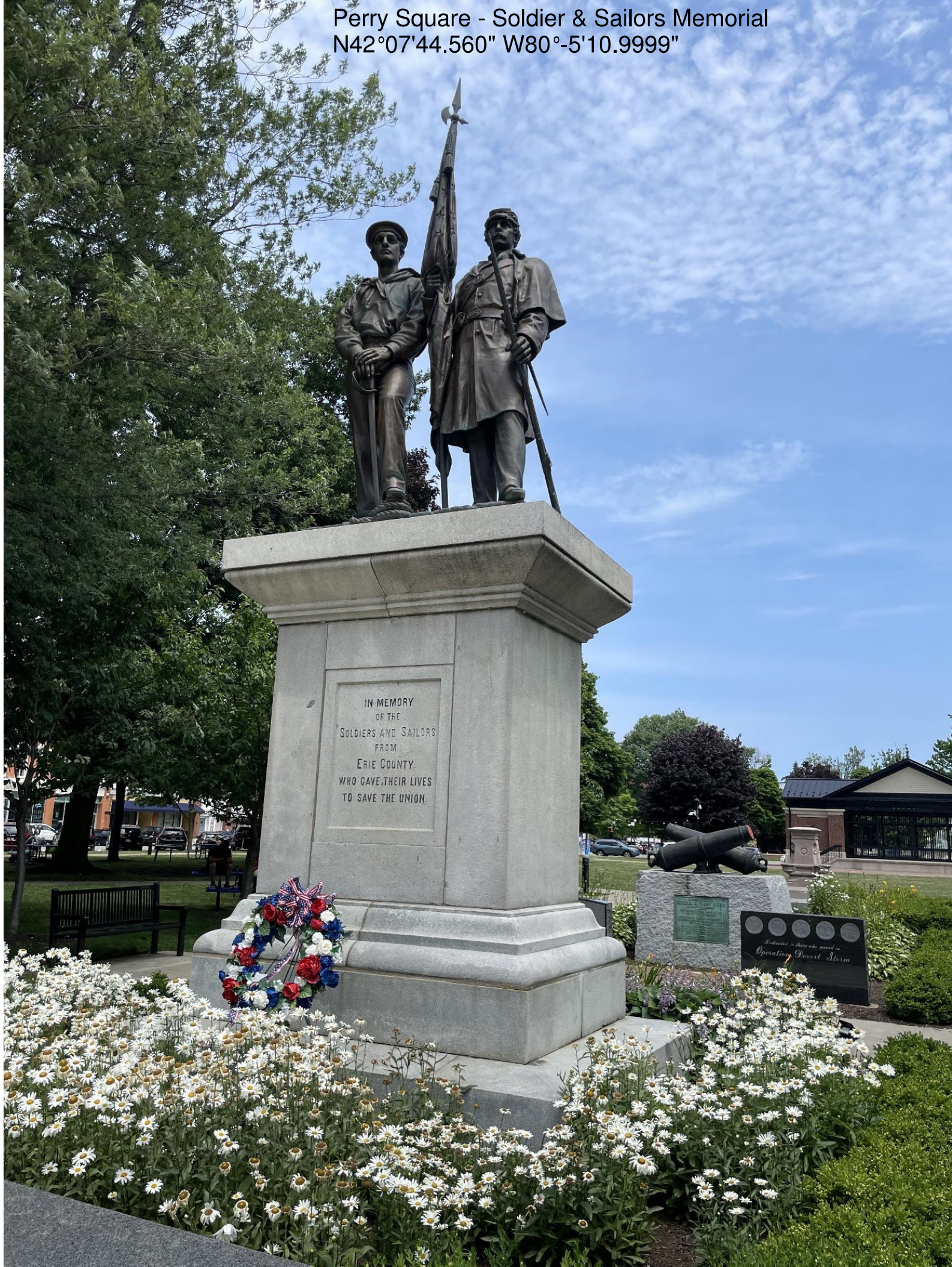
Perry Square - Soldier & Sailors Memorial N42°07'44.560" W80°-5'10.9999"