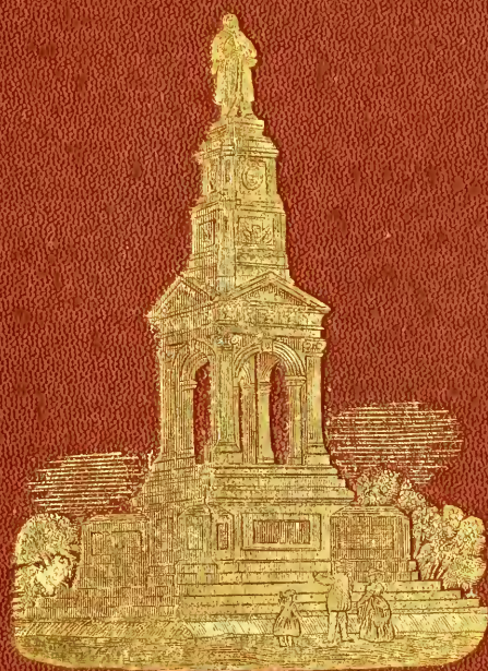
SOLDIERS' MONUMENT, CAMBRIDGE.