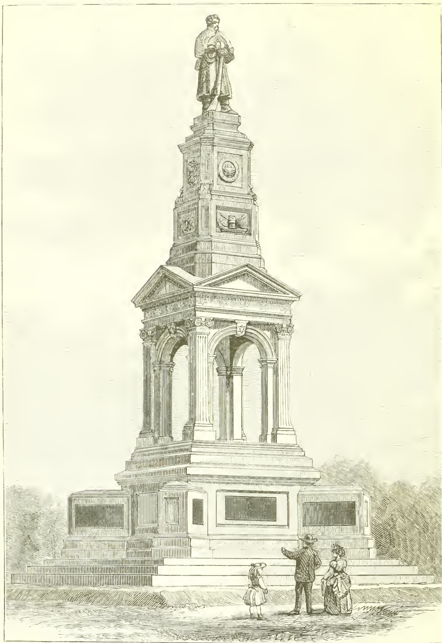
SOLDIERS' MONUMENT, CAMBRIDGE.