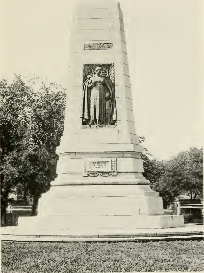
FIGURE REPRESENTING "CHARITY."