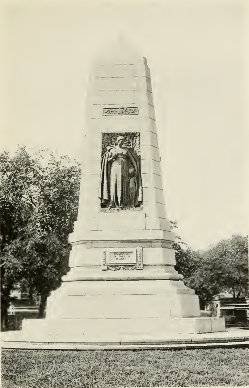
FIGURE REPRESENTING "CHARITY."