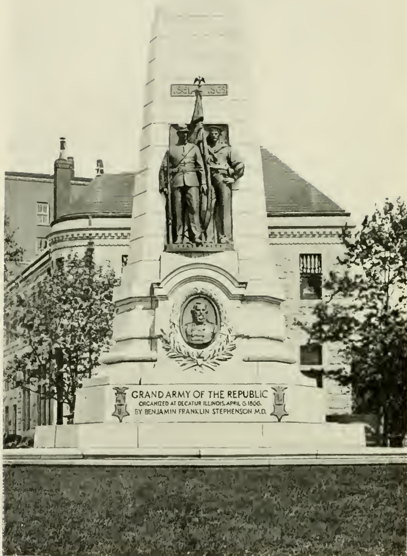
FIGURES REPRESENTING "FRATERNITY."