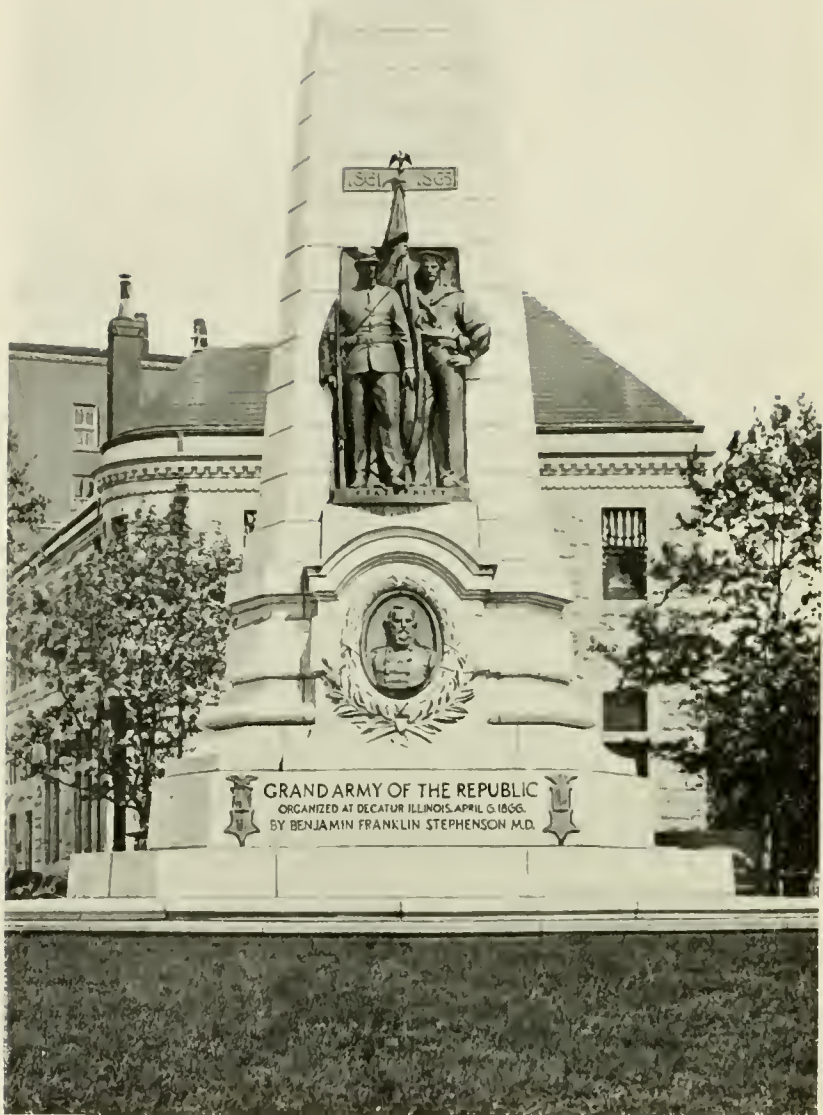
FIGURES REPRESENTING "FRATERNITY."