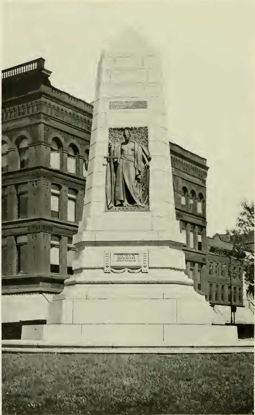
FIGURE REPRESENTING "LOYALTY."