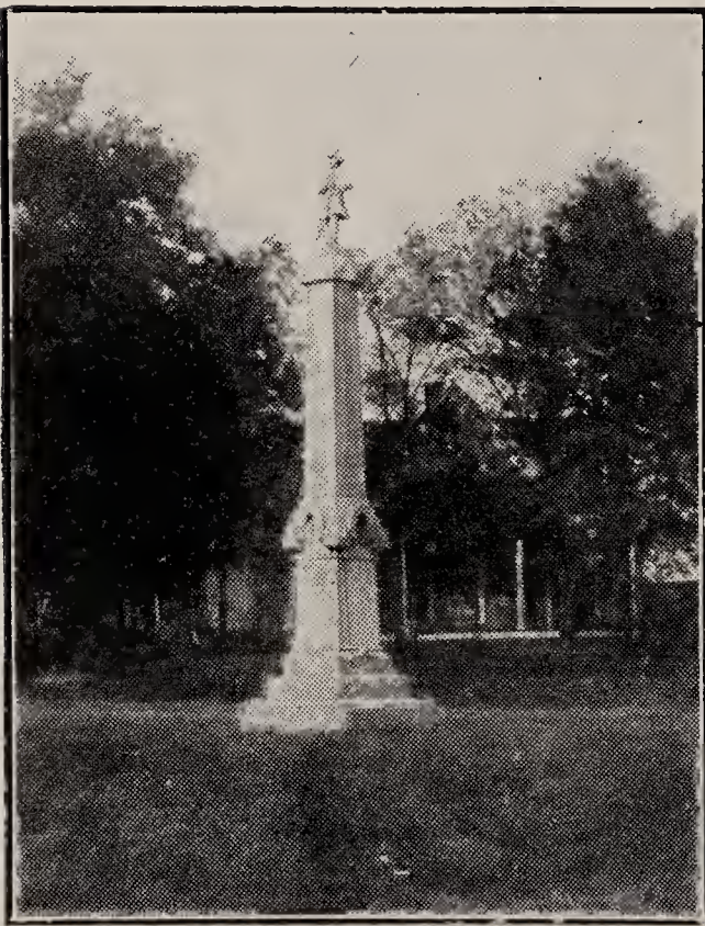
DEDICATED SEPTEMBER 1893

On a little tri-angular piece of ground near the track of the Southern railroad, in Oakland City, there stands a modest appearing shaft that attracts the attention of