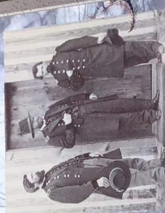
Brigadier General John A. Rawlins (left), Lieutenant General U.S. Grant (center), Lieutenant Colonel Theodore S. Bowers (right) pose on the porch of the cabin.

This is one of 22 cabins that stood on the Eppes property. After the war, Grant's cabin was moved to Philadelphia, where it remained on display for 116 years. In 1981 the National Park Service returned the cabin to City Point and reassembled it on its original site. About 10% of the structure is original. It is one of the few relics of US occupation at City Point.