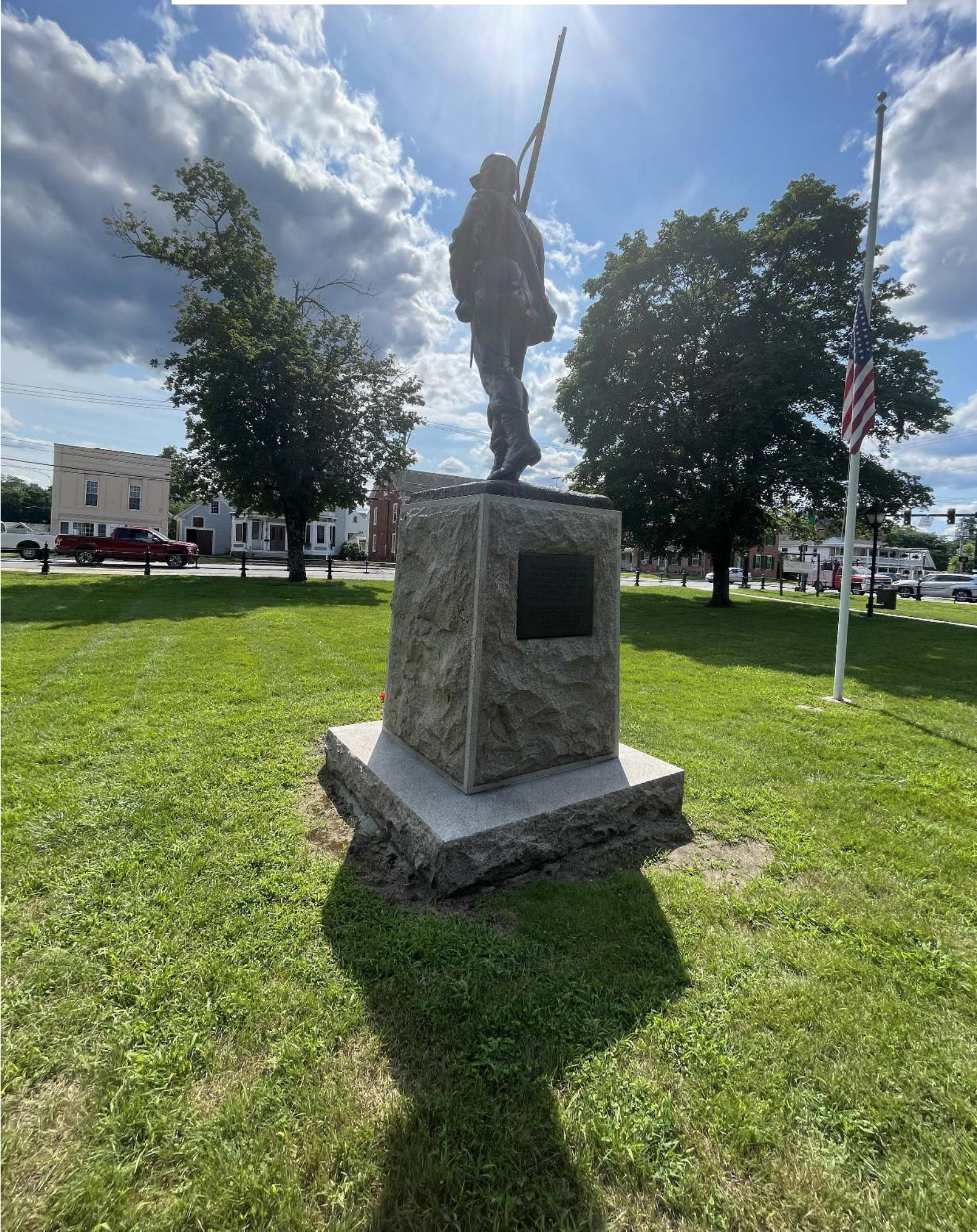
Townsend, MA N42°40'00.941" W71°42'19.128" "The Volunteer" Designed by Theo Alice Ruggles Kitson