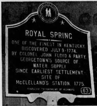
Marker At Main And Weber, Georgetown.