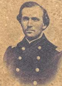
Col. John Hunt Morgan After Morgan's defeat in Lebanon, Tennessee he set out on a brief raid into Kentucky to the Green River country, where he began his military career. He found Bowling Green was too well guarded, so he rode north to Cave City.