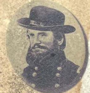
Gen. George W. Morgan After Morgan's Cave City Raid, Union Gen. George W. Morgan deployed infantry to guard trains and stations in Central Kentucky. (George W. and John Hunt Morgan are not related.)

The next day at noon, guards north of Cave City heard a passenger train approaching, bound for Nashville from Louisville. Morgan's men blocked the tracks, stopping the train while other troops threw logs on the tracks behind the train, preventing a reverse run. Morgan confiscated $6,000 in cash from the express agent and captured two Union officers and several enlisted men. He then allowed the train to return to Louisville safely. Stories of the Cave City Raid and its success took on the trappings of a romantic saga of chivalry due to the way in which Morgan treated the train's female passengers. "I have no right to look into ladies baggage, or to examine their trunks. Southern gentlemen do no such thing" Morgan is reported as saying.