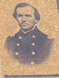
Col. John Hunt Morgan After Morgan's defeat in Lebanon, Tennessee, he set out on a bold raid back to the "Copperhead" Blue-Unionist where he forged his military career. He took a bold line, or what today is said, grand as the raid itself by the Union Army.