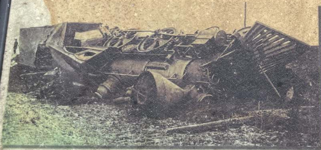
Morgan wrecked one train and robbed another while in Cave City.