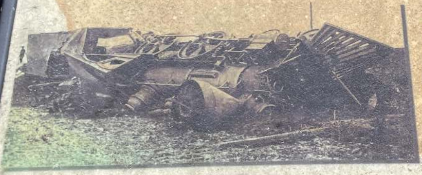
Morgan wrecked one train and robbed another while in Cave City.

The next day at noon, guards north of Cave City heard a passenger train approaching, bound for Nashville from Louisville. Morgan's men blocked the tracks, stopping the train while other troops threw logs on the tracks behind the train, preventing a reverse run. Morgan confiscated $25,000 in cash from the express agent and captured two Union officers and several enslaved men. He then allowed the train to return to Louisville safely. Stories of the Cave City Raid and its success took on the trappings of a romantic saga of chivalry due to the way in which Morgan treated the train's female passengers. "I have no right to look into ladies baggage, or to examine their trunks. Southern gentlemen do no such thing," Morgan is reported as saying.