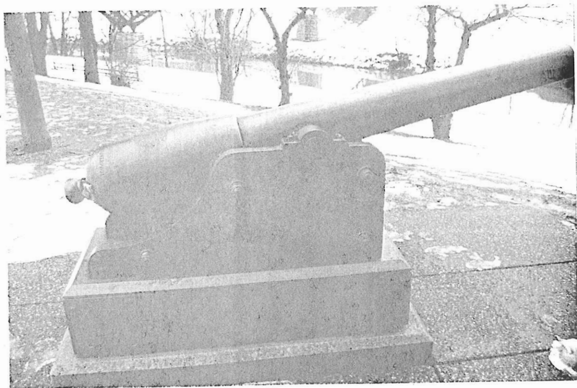
1860 Blakely Rifle, Galena