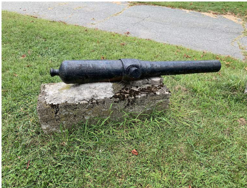
Cannon one. Notice the front of the cannon resting on a broken patio brick