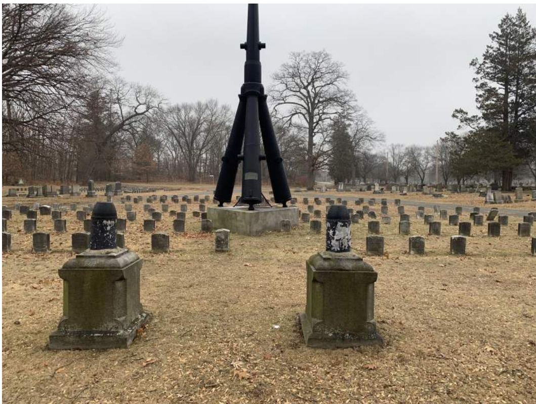
Photo showing the concrete shell casings at the entrance to the plot.