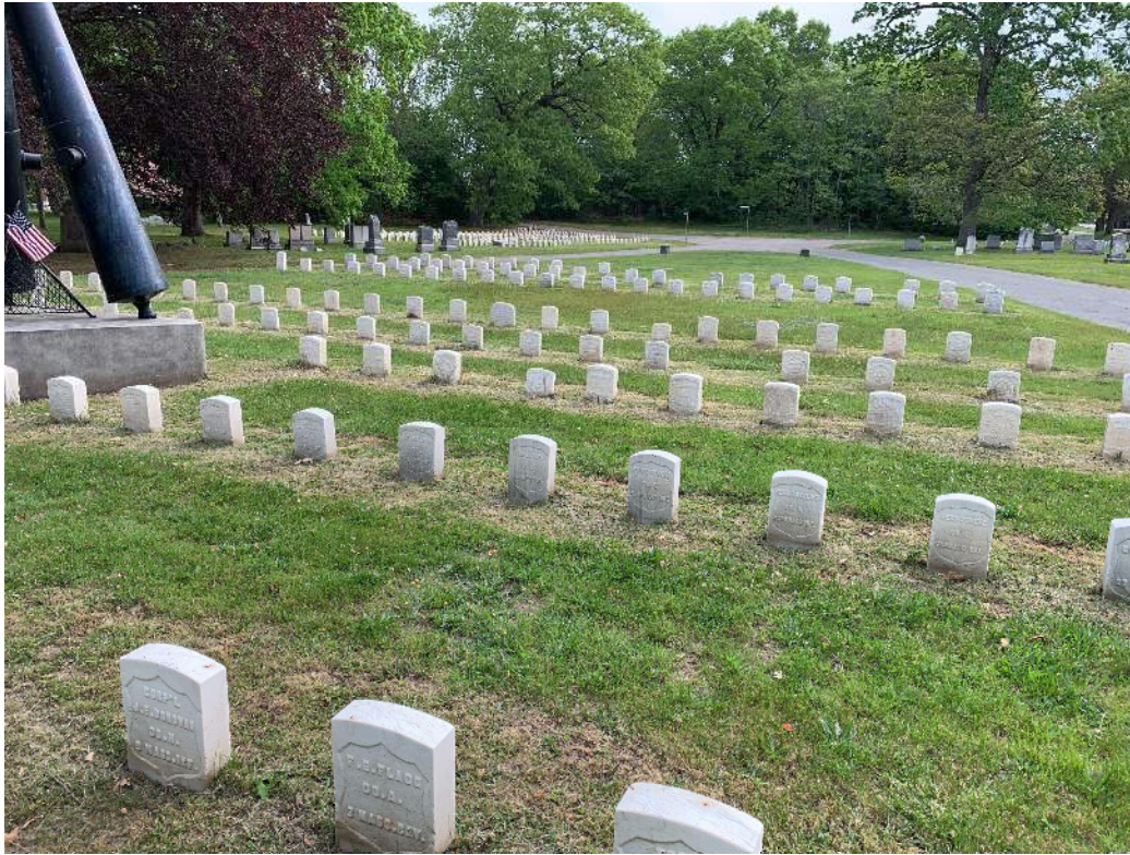
Photo showing straightening and cleaning work done by Mass SUVCW brothers