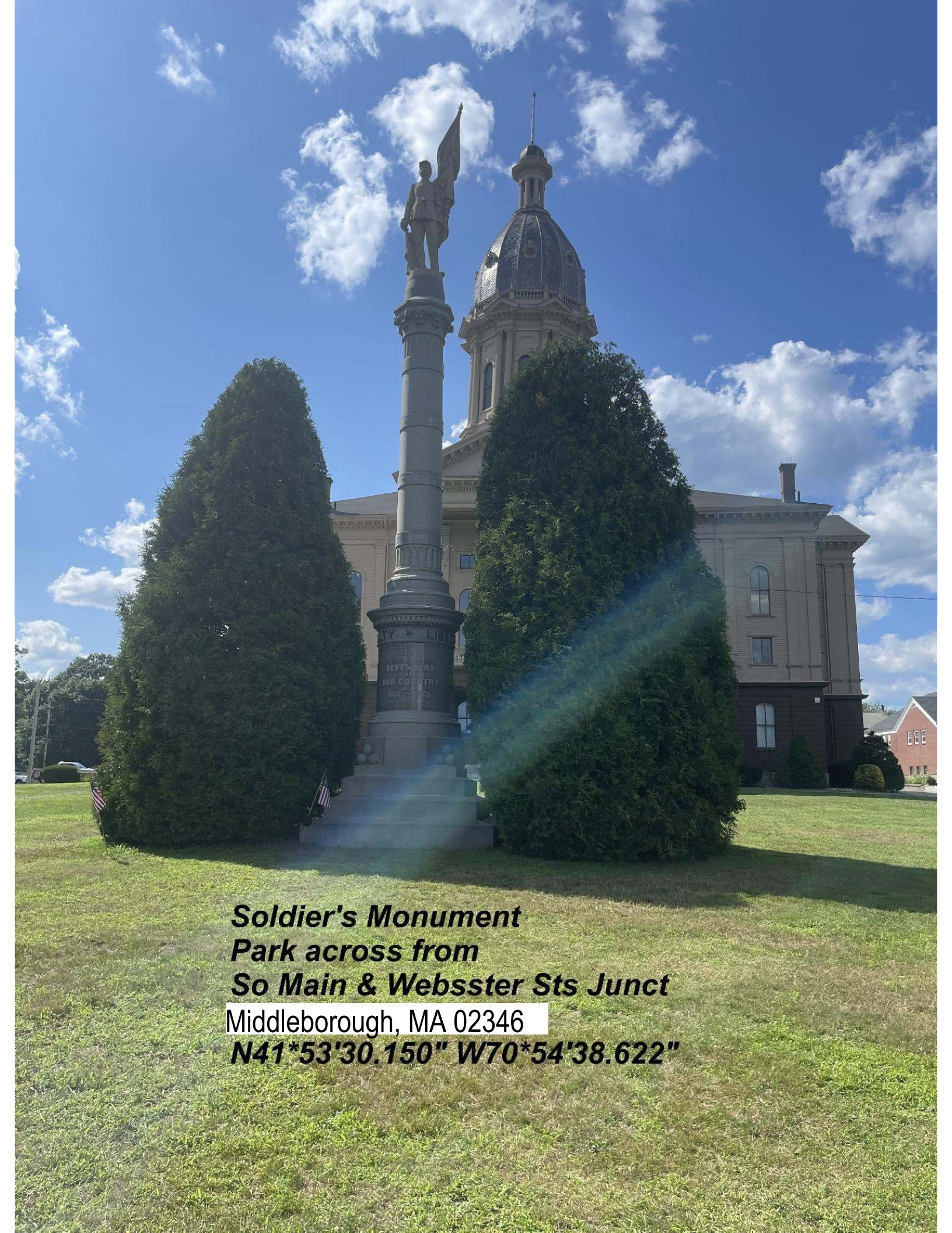
Soldier's Monument Park across from So Main & Websster Sts Junct Middleborough, MA 02346 N41°53'30.150" W70°54'38.622"