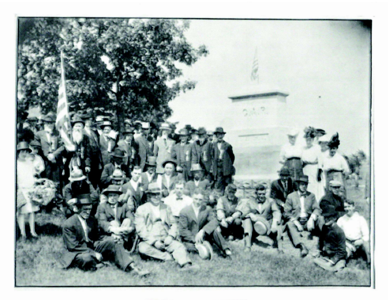
PRINT THIS INFORMATION