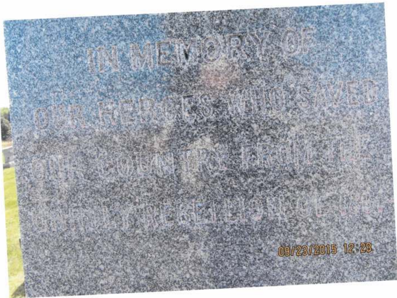
NORTH FACE SHOWING ENGRAVING