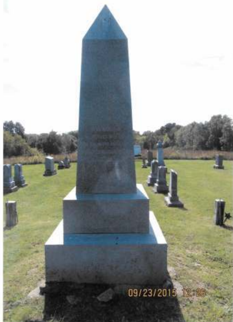
NORTH FACE SIDE VIEW