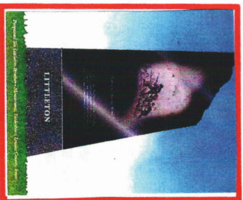
"The Last Full Measure of Devotion"

ALL DIED IN THE CIVIL WAR This Monument Honors That Ultimate & Historic Sacrifice