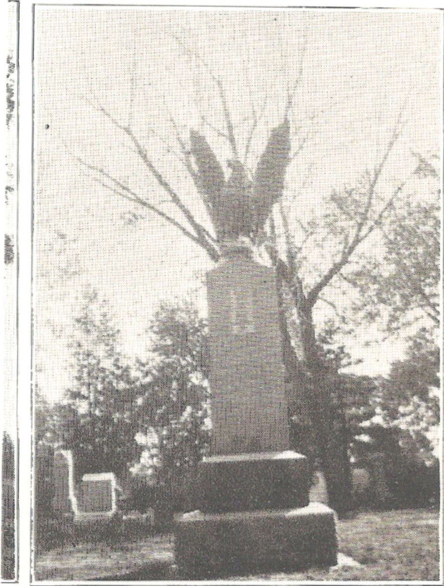
ERECTED AND DEDICATED IN MEMORY OF THE G. A. R., 1927 By Beldon No. 230, Woman's Relief Corps, Missouri Valley, Iowa