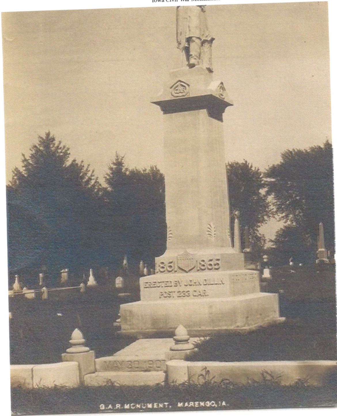
G.A.R. MONUMENT, MARENGO, IA.