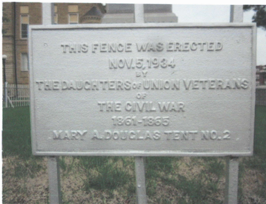
Soldiers' Monument, Chariton, Iowa