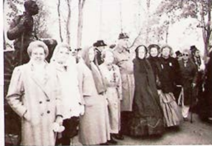
Representatives of the Allied Orders of the Grand Army of the Republic gather in front of the Woolson Monument with their tributes to the "Boys in Blue".