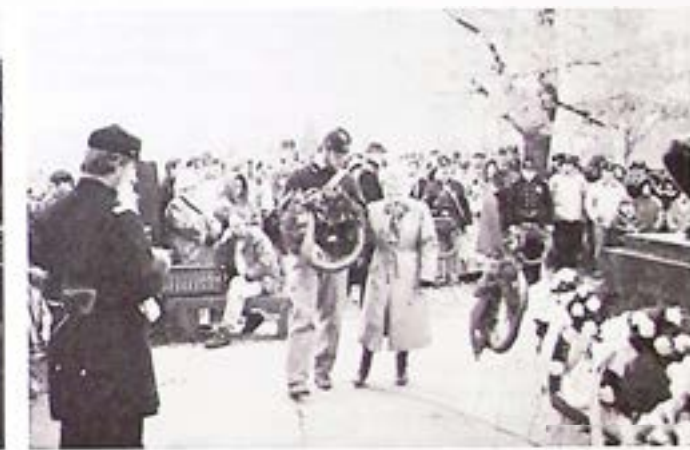
Members of the Allied Orders of the Department of Pennsylvania presented memorial wreaths.