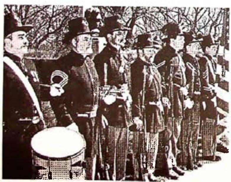
1985 Lincoln Tomb Ceremony Color Guard.