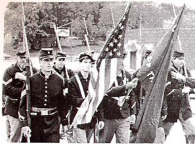
Davis Star Camp Honor Guard in 1988