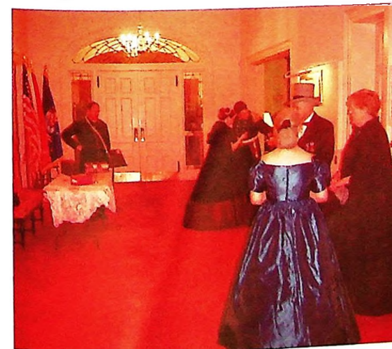
Arriving at The Century Club, left, for the grand ball with music by the 28th Regimental Brass Band.

Scenes from the first of what will be an annual SVR Ball in Scranton, PA. The event, attended by some 125, is used to raise funding to aide the Delaney Delacy Guard in its development of a Youth Cadet Fife & Drum Corps. Some 48 students, between the ages of 8 and 14, benefit from the program.