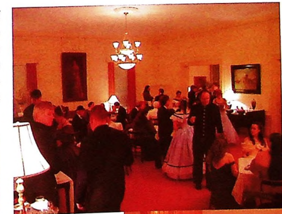
Taking light refreshments in the Club's Tea Rooms.