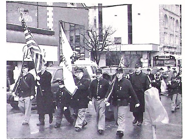
Sons of Union Veterans from The Col. David Ireland Camp of Binghamton, NY march in Scranton, PA to assist Camp 8 in rededication of the General Sheridan Monument April 2.