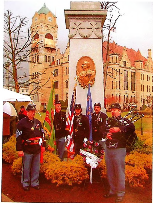
Restoration of the General Phillip Sheridan Monument in Scranton, PA, was funded through donations in the community and through a grant by the Sons of Union Veterans of the Civil War. Rededication ceremonies were conducted April 2 by the SVR.