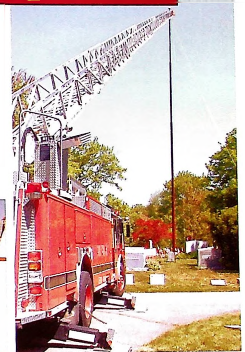
Dunmore Fire Department's 110-foot ladder assists Delaney Delacy Guard, SVR, of Scranton, PA in restoration to service of a 1911 50-foot flag pole at the GAR Plot in the Forest Hills Cemetery. Two other flag pole restoration projects are planned by the Guard in 2005.

Scenes from the first of what will be an annual SVR Ball in Scranton, PA. The event, attended by some 125, is used to raise funding to aide the Delaney Delacy Guard in its development of a Youth Cadet Fife & Drum Corps. Some 48 students, between the ages of 8 and 14, benefit from the program.