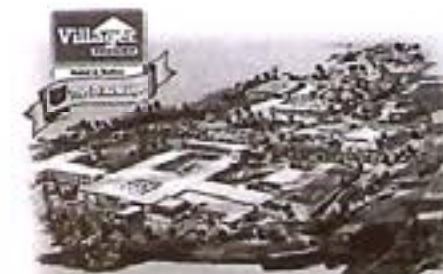
THE DRAWBRIDGE Villager Premier Hotel

Also, for those wanting to explore downtown Cincinnati or the No. KY waterfront, a shuttle bus runs every half-hour from the Drawbridge Inn.