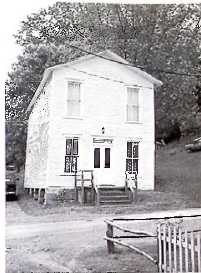
Fresh paint brightens the 107 year old GAR Hall

There are only two other GAR Halls in Ohio still regu-