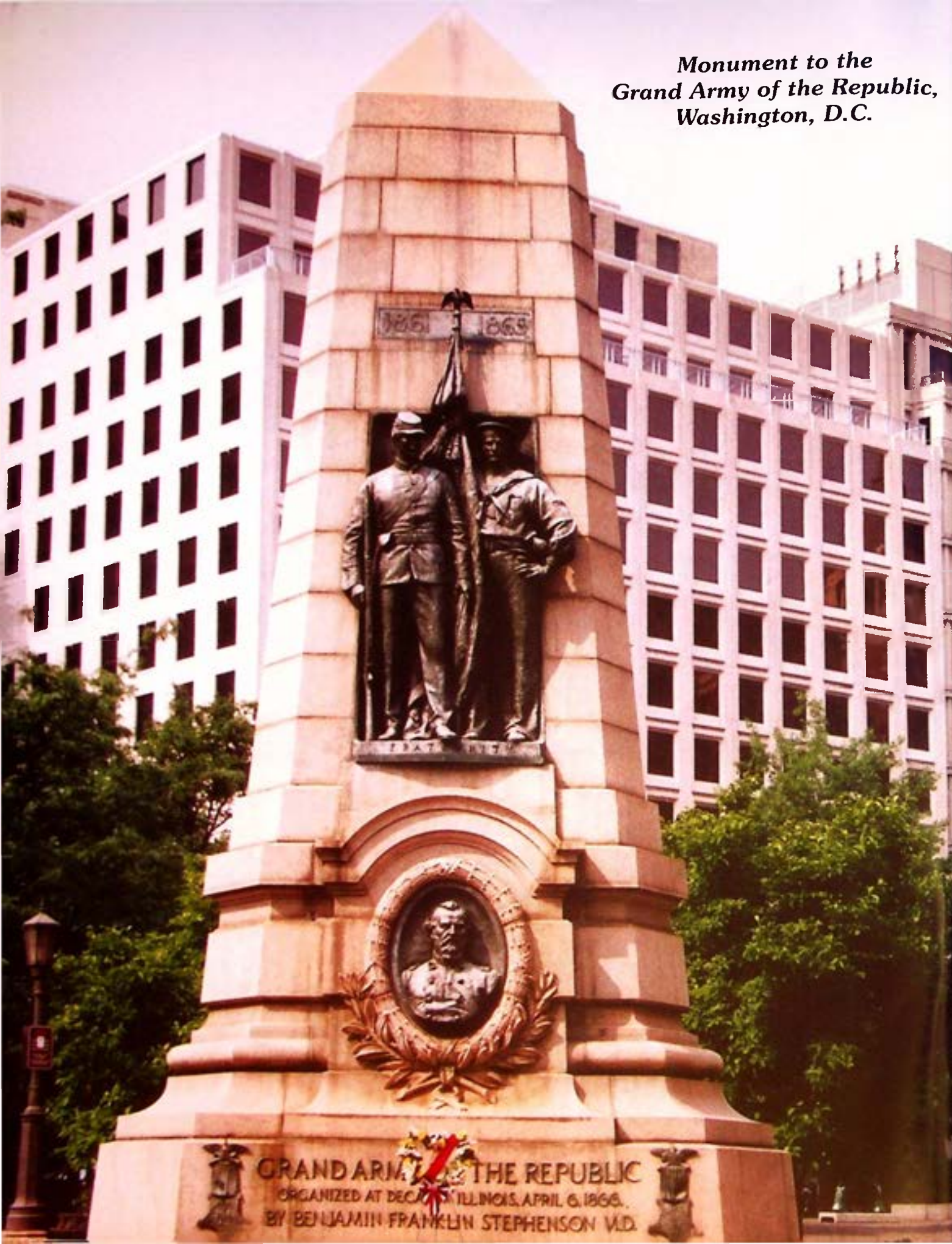
Monument to the Grand Army of the Republic, Washington, D.C.