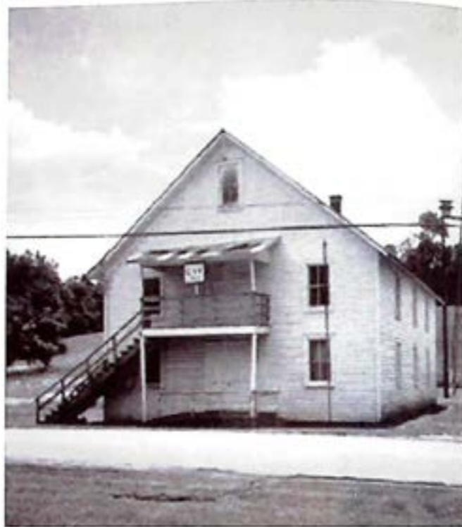
109 Years of Service. The GAR Hall in Halsey Valley, New York, now on the National Register of Historic Places.

More needs to be done in order to ensure that this GAR Hall will endure for future generations. Anyone who would like to see this historic Hall preserved would be