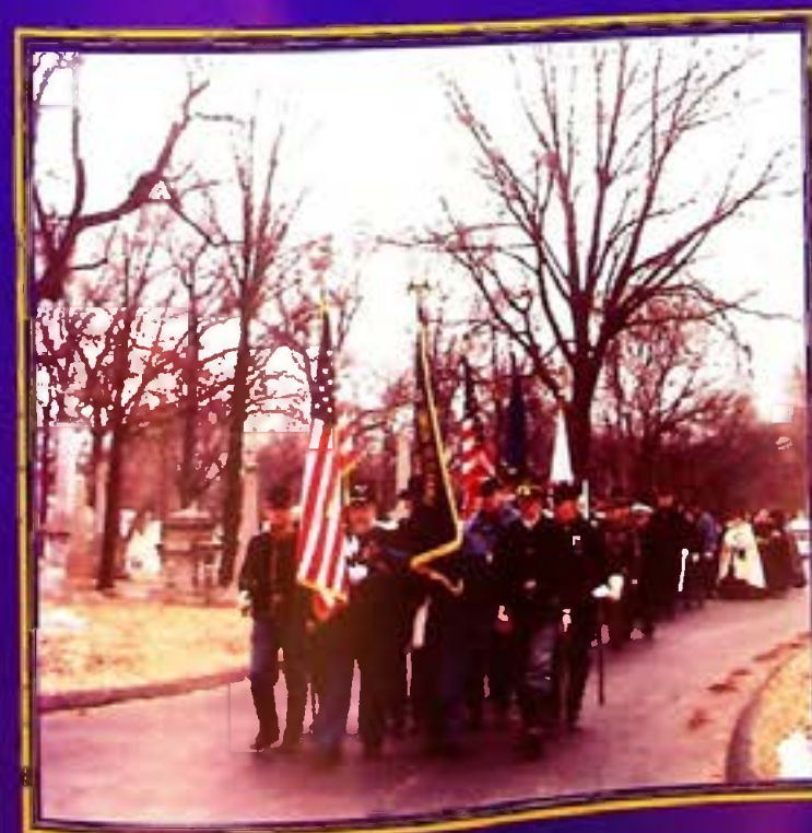
St. Louis, MO: Members of the William T. Sherman Billy Yank Camp 65, Department of Missouri and others are pictured as they enter Calvary Cemetery to take part in this year's program to mark the 183rd Anniversary of General Sherman's Birth.