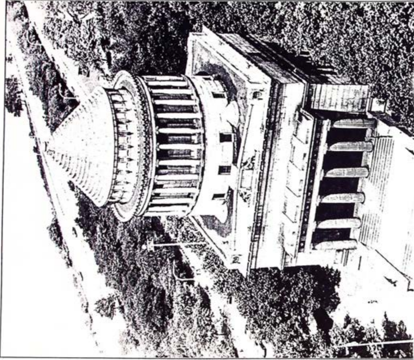
Grant's Tomb, New York City: an aerial view