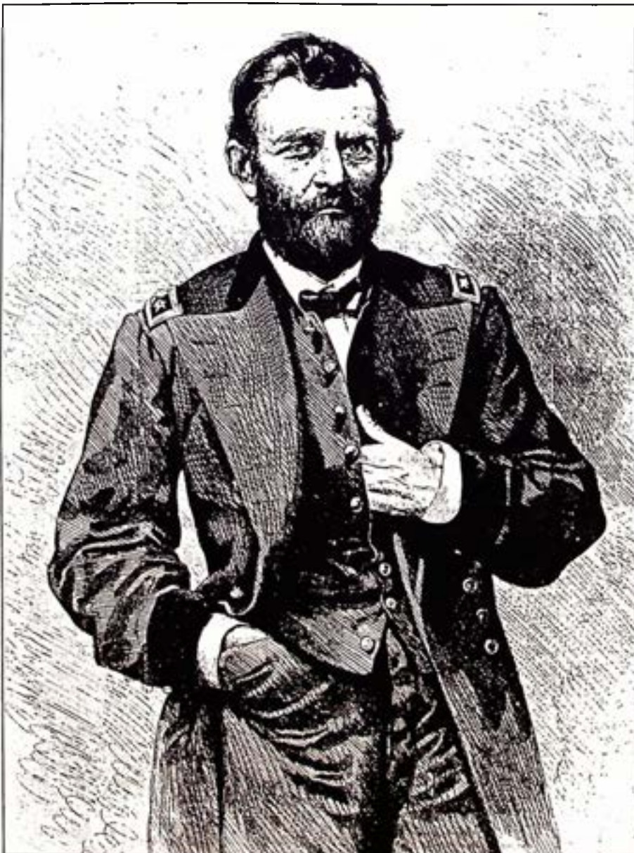
Lt. Gen. U. S. Grant

Besides failing to address these issues effectively, the National Park Service (NPS) has installed impediments to what should be the tomb's reverential atmosphere, and it has engaged in the intentional destruction of major features of the site and its archival collection. NPS has also refused to address a variety of other problems, such as lack