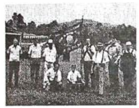
Dennison Camp #125, joined together for a recent cannon shoot. This Camp was responsible for the Resolution on page 3.