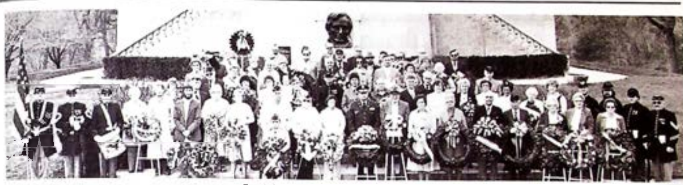
Participants in Lincoln's Tomb Ceremony

Administration shall elect the Editor of the Proceedings and determine the amount to be appropriated in each yearly budget to defray the cost of publication of the Proceedings and Its mailing.