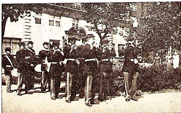
Fife and Drum Corps of Camp 15, Harrisburg, Pa., shown playing at the wreath laying ceremonies at Lytle Park, Cincinnati.