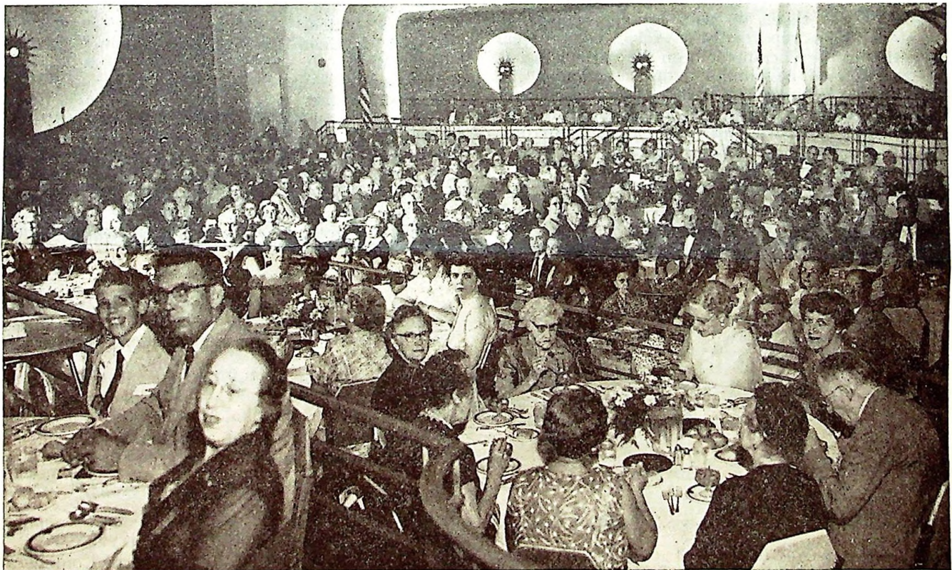
General view of the Banquet honoring the Commander-in-Chief and the National President of the Sons and Auxiliary, held in the Pavilion Caprice of the Netherland-Plaza Hotel, Cincinnati.