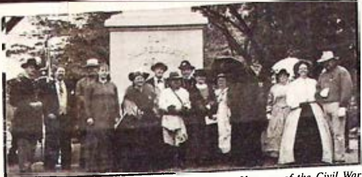
Sons of Confederate Veterans and Sons of Union Veterans of the Civil War from the Department of Tennessee participate at a recent rededication of a local cemetery.

Following dinner, department officers, friends and family were introduced that were in attendance. We were fortunate to have