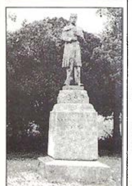
The G.A.R. Nathanal Lyon Post 5 monument in Denison, Texas, is only one of three monuments to the Union in Texas.

This article is based upon information recorded in the minute books of Davis * Camp, Department of Pennsylvania, several proceedings of National Encampments and observations of badges in my collection and collections of other brothers. With the issuance of the Congressional Charter to the SUVCW, all of these badges have been protected in perpetuity. No entity except the National Organization can legally reproduce any present or former badge used by the SUVCW or the Sons of Veterans, USA.