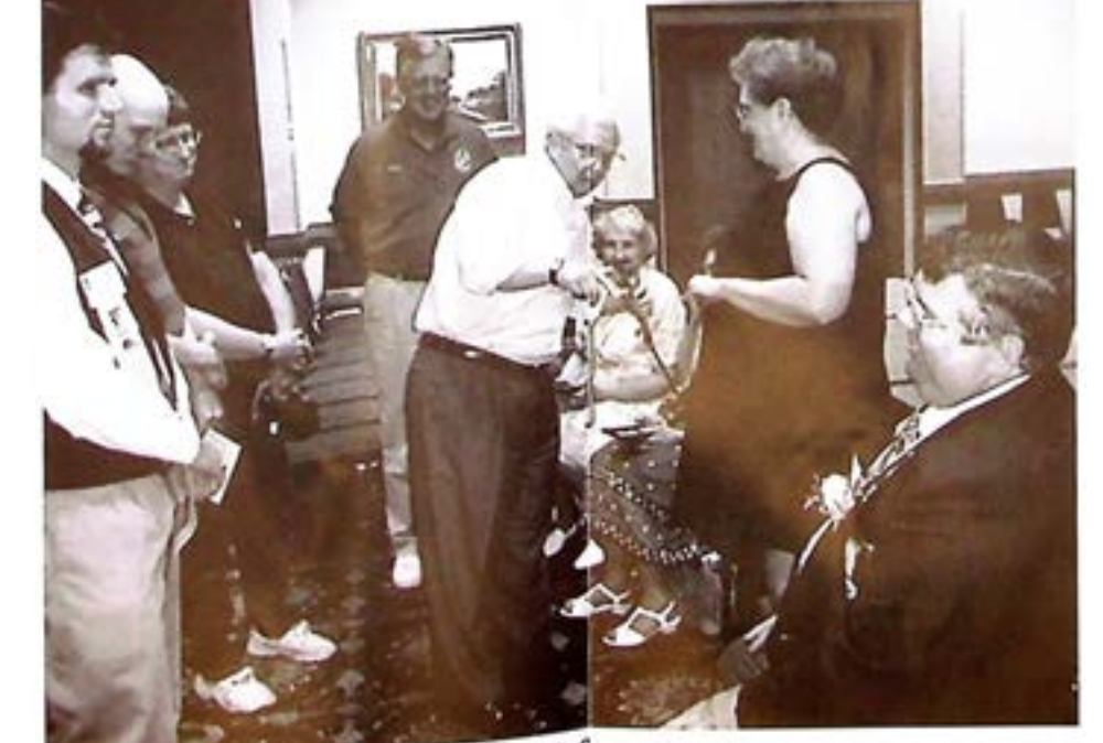
Fun time for the Commander-in Chief.