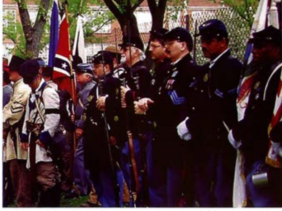
Both Union and Confederate forces participated in the burial of the unknown soldiers

The skeleton was discovered on July 10. 1999, near the Missionary Ridge Battlefield by someone digging in his backyard. The fragmentary remains were taken to the Hamilton County Medical Examiner's Office where a county forensic anthropologist, a state archaeologist, and a military historian determined that they were of a male adult between 25 and 45 with a height of about 5 foot 6 inches. Also uncovered were several hobnails of a boot, a leather eyelet and a rivet from a map case or ammunition pouch that were from the 1860's time pe-