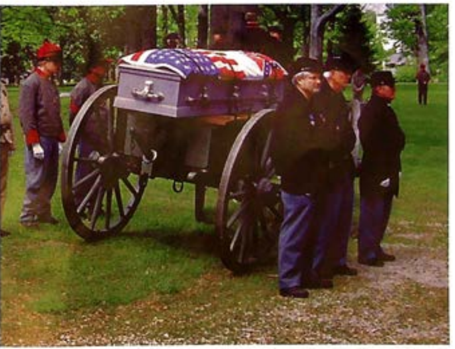
Horse drawn caisson carries casket of unidentified Civil War soldier flanked by Confederate and Union pallbearers.

The night before the burial a memorial service was held at Christ Episcopal