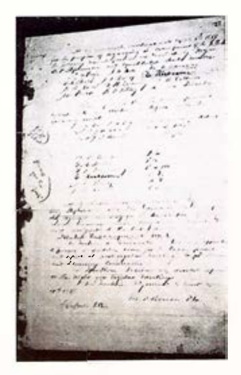
MINUTES OF FIRST MEETING

The two most valuable documents associated with the history of the Grand Army of the Republic are the original charter of Old Post No. 1, Decatur, and that post's minute book. For many years the whereabouts of these documents remained a mystery. With the early demise of the first Decatur post, and the subsequent reassignment of "No. 1" by the Department of Illinois to the G.A.R. post in Rockford, the effects of Old Post