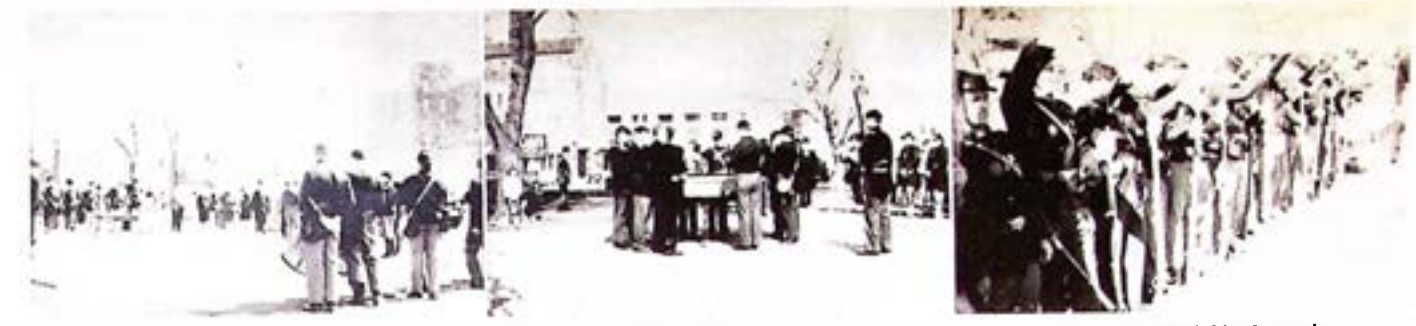
THE G.A.R. CENTENNIAL OBSERVANCE IN DECATUR, ILL. - These are the pictures which were unavailable for pub-lication in the preceding issue, Left, spectators and participants assemble in the park for re-enactment of first G.A.R. post's chartering ceremony; center, those portraying charter members stand before coffin as oath is given; right, 101th Illinois Vol. Inf. prepares to fire memorial salute.