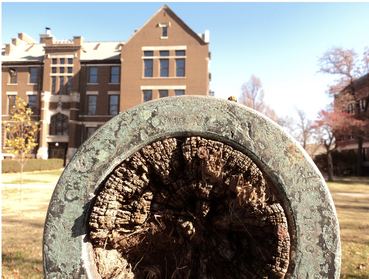
Taken 2011 --- Looks like the markings read "No. 45" and "1863"