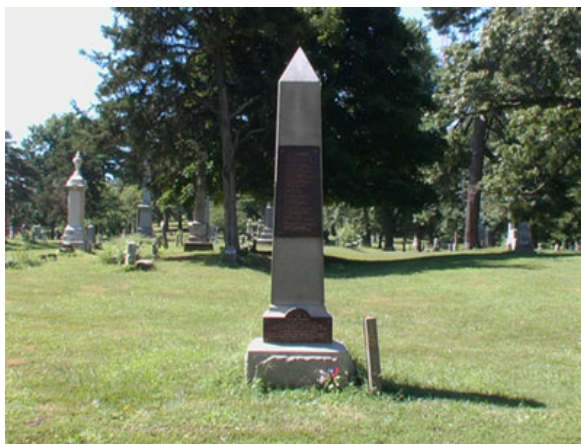
Unknown Confederate Gravesite Monument

Somewhere among the 27 acres of Kansas City's Union Cemetery lie the remains of 15 Confederate soldiers. The men died while held as prisoners of war in Kansas City after the Battle of Westport. Although their gravesites are unknown, the U.S. government erected a granite obelisk to commemorate the soldiers in 1911. Numerous veterans from the Revolutionary War to the Vietnam War are also buried in the cemetery, as are many prominent 19th century Kansas City residents. In 1849, a cholera epidemic hit the Missouri towns of Westport and Kansas (now Kansas City). With the towns' respective cemeteries near capacity, they decided to form a "union" and establish a new cemetery between the municipalities. The Missouri state legislature authorized a corporation, which eventually selected a 49-acre site between the two towns for Union Cemetery.