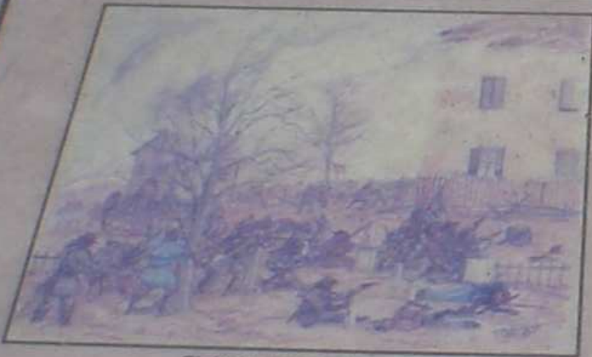
Fight in the cemetery