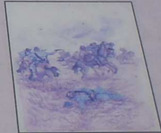
Kickapoo Prairie calvary skirmish