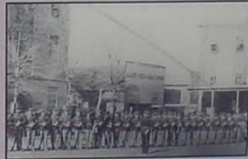
Union troops assembled on the square in Springfield