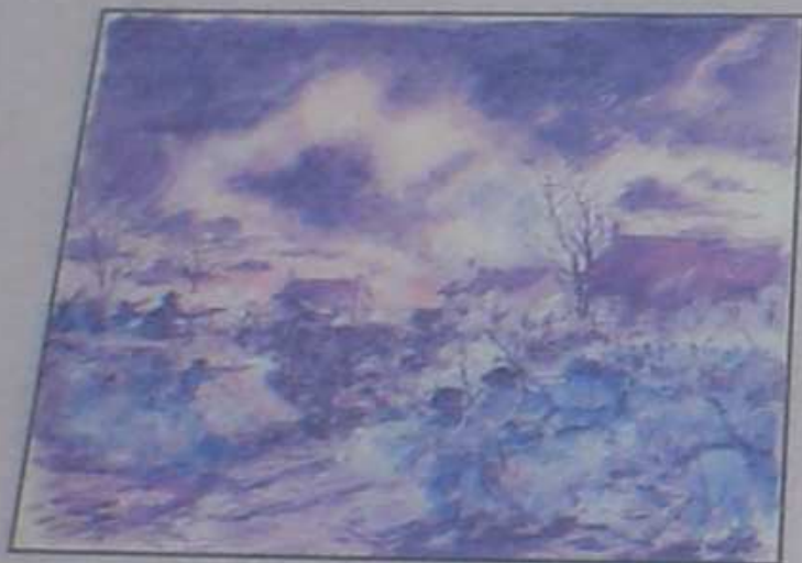
Fight after sundown

Watercolor painting by O. L. Coombs