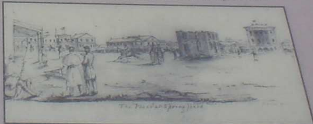
1851 illustration from Harper's Weekly of the Plaza at Springfield looking northwest

On January 6, 1863, Brig. Gen. John S. Marmaduke entered Missouri with nearly 2,300 veteran Confederate cavalry to attack Union supply lines and communications and to disrupt the Union thrust into northern Arkansas. Springfield, lightly defended but with vast warehouses of military supplies, made a tempting target. In the late afternoon of January 7, Union Brig. Gen. Egbert B. Brown, at headquarters on the square, received frantic reports that 6,000 southerners were approaching. Brown, with approximately 2,100 troops, decided to stay and fight. Entrances to the square were barricaded with a steam boiler from the old courthouse, wagons and bales. Cavalry patrols were dispatched to scout the enemy and rouse the militia, as Brown hastily organized the city's defenses.