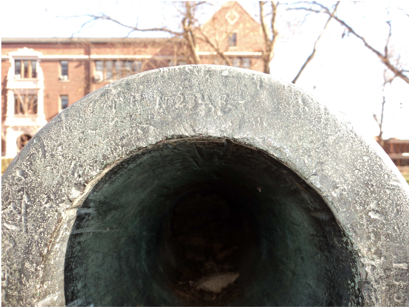
Looks like it is marked "N23AB"