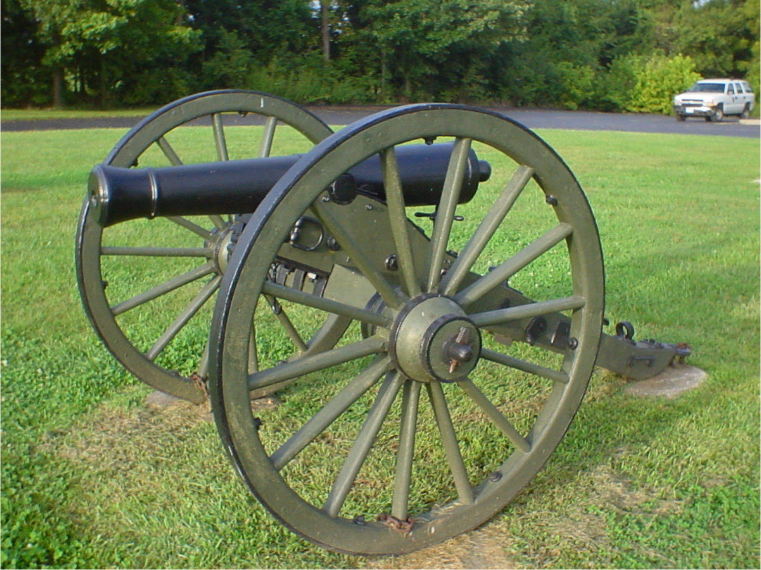
SWEENEY MUSEUM CANNON