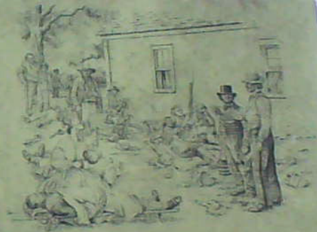
The Ray House served as a hospital during and after the battle.