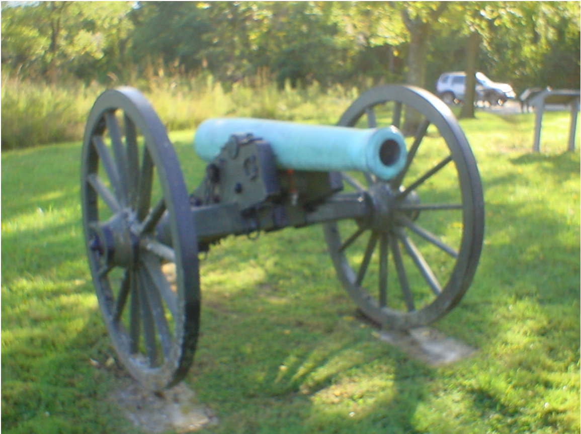
Guibor's Cannon 1