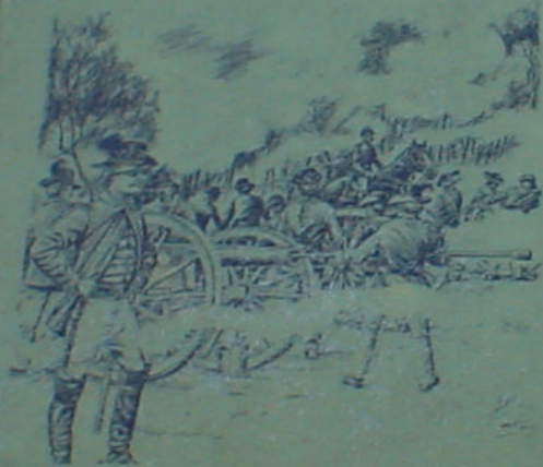
Union artillery batteries on this hill dueled with opposing batteries in the valley and across the creek.