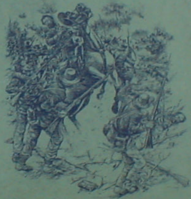
A musket ball in the chest struck down General Lyon not far from here. His death dampened Union hopes.