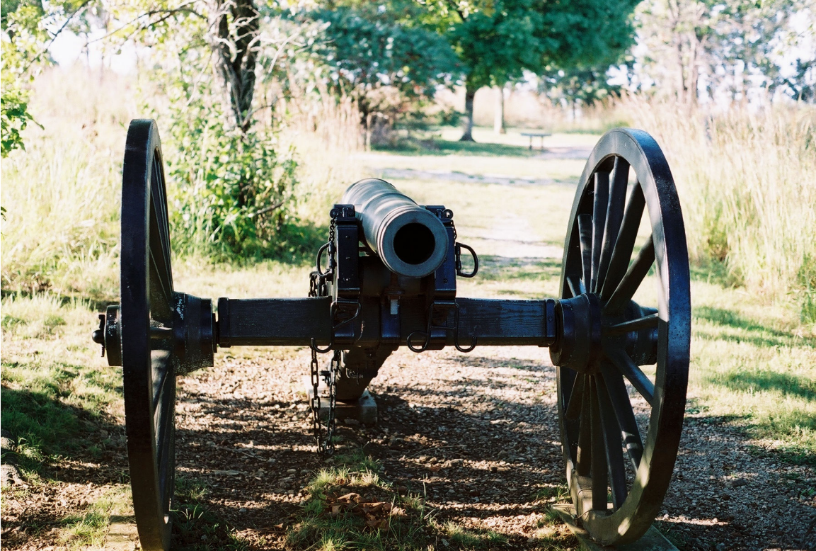
Bloody Hill Cannon