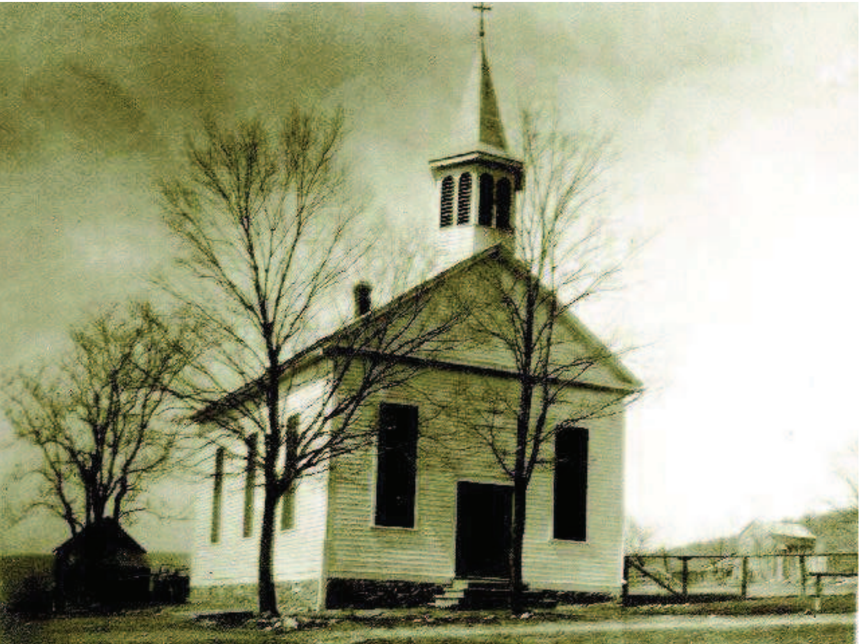
Immanuel Lutheran Church Pilot Knob MO Circa 1900